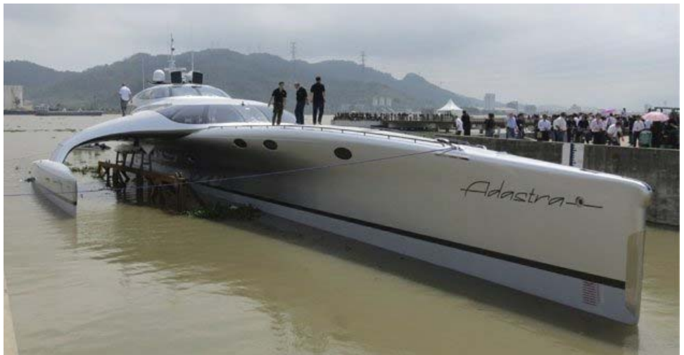
Adastra super yacht