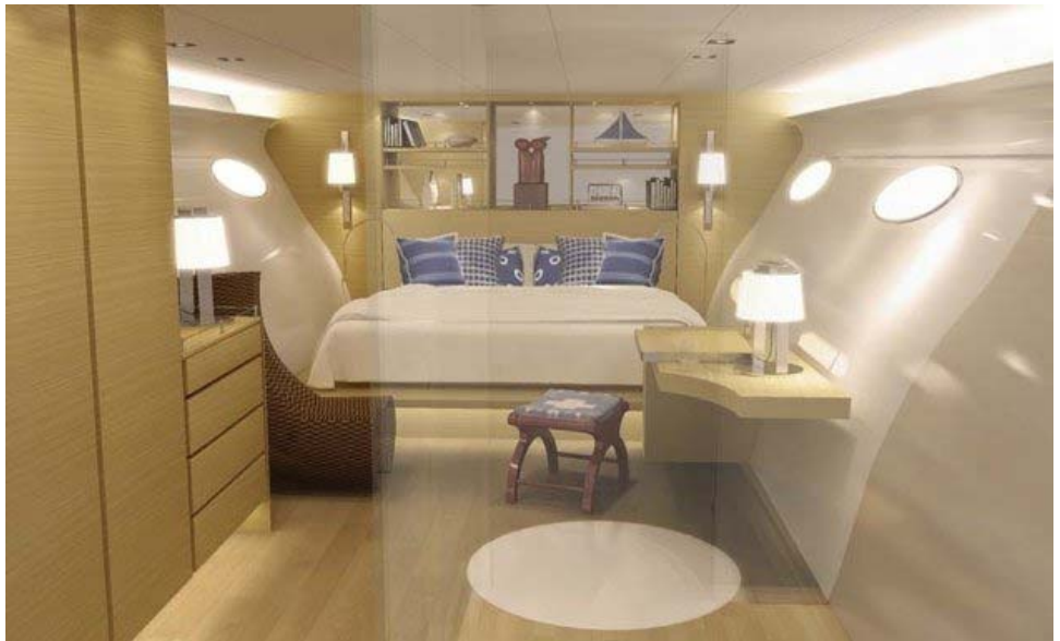
Adastra super yacht