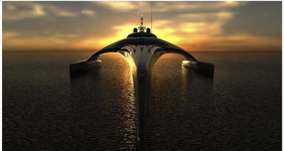
A project 5 years in the making finally sails into the sunset