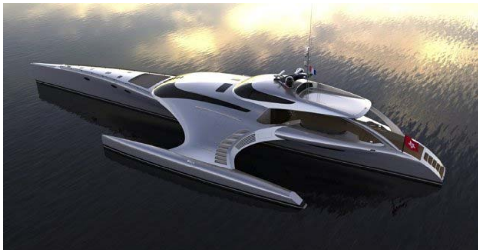
Adastra super yacht