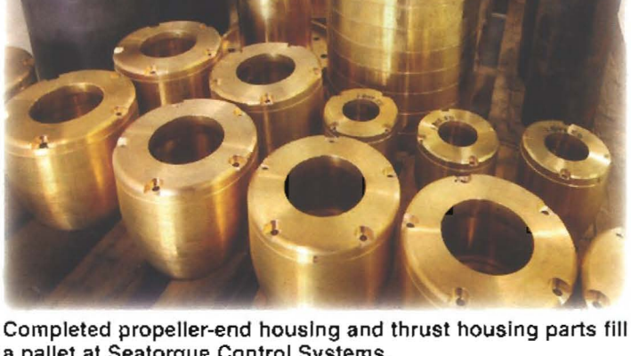
a pallet at Seatorque Control Systems.

Seatorque markets the innovative bolt-on packages to a growing list of boatbuilders all over the world. After winning multiple international design awards in 2006, the product attracted