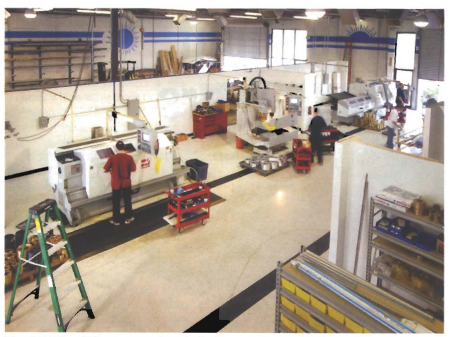
The 10,000sqft Seatorque shop is bullt around Haas CNC machines.

considered transitional machines that can be used in either CNC or traditional manual modes, but Seatorque opts to use the uncomplicated equipment for full-on CNC production only.